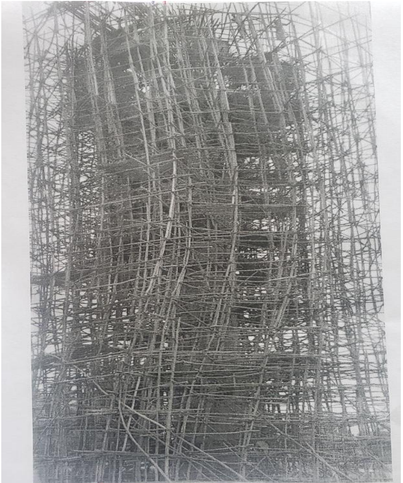
Figure-1 Twisting of wooden Scaffolding

The pictures below were taken in construction sites located in Agaro town during the Questionnaire survey