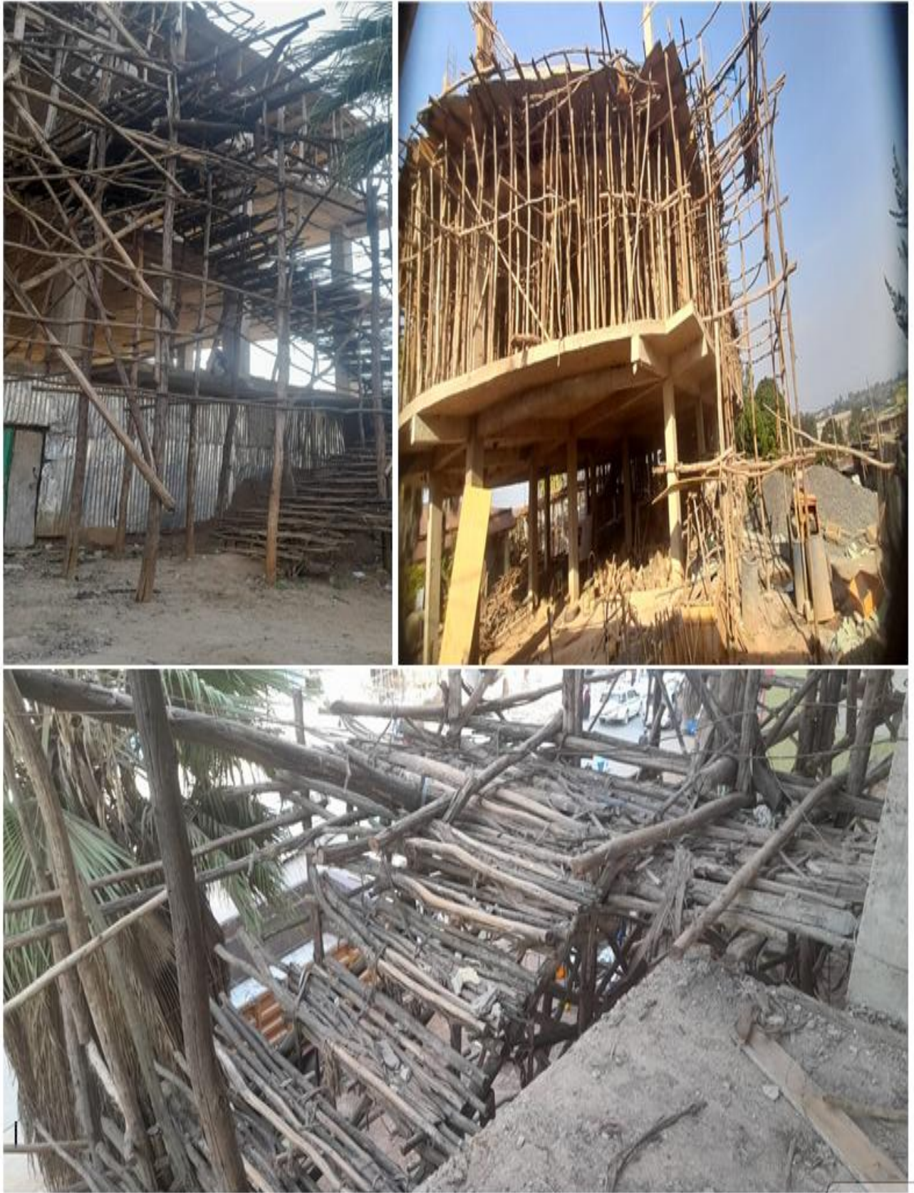
Figure-2 Un proper usage of ladder and dismantling of sold slab form work