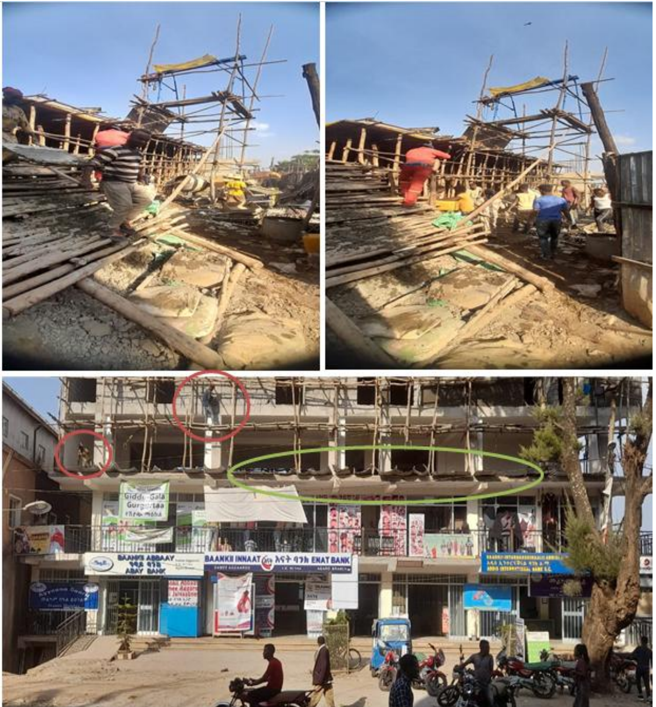
Figure-3 Un proper usage of construction materials mobilization and plastering works

The above figures were taken from building construction sites located in Agaro town. According to international occupational safety and health standards construction work should be fenced off to protect people from site dangers. However, these contractors were executed their works without any safety rules barrier.