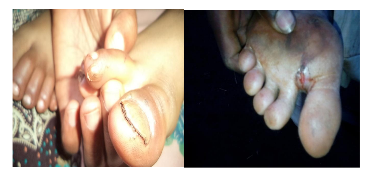
Plate 9 Embedded jigger flea a photo by Taye Berhanu February, 2015 Plate 10 Feet wounded b/c of un saved extraction of flea a photo by Taye Berhanu February, 2015