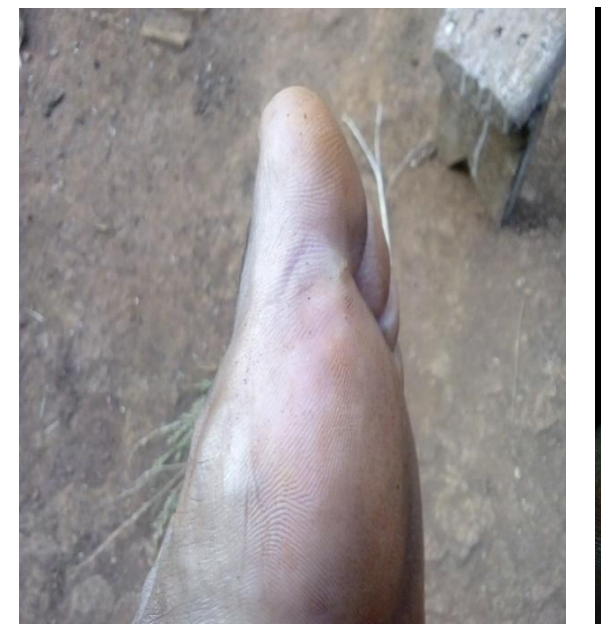
Plate 7 Embedded jigger flea February, 2015