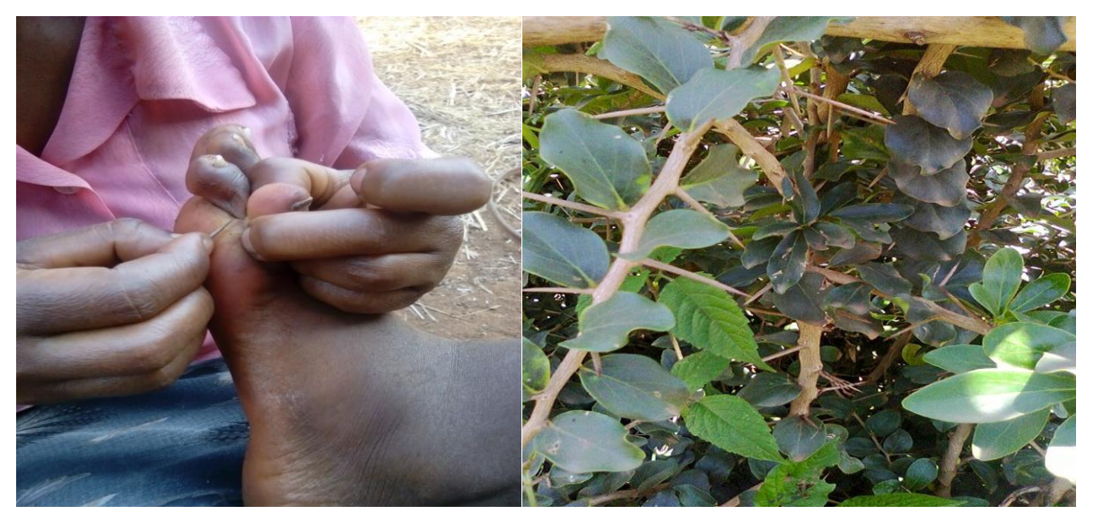
Plate 1 Extraction of jigger flea by Dovyalis caffra , ( photo credit Taye Feb.2015 ) plate 2 Dovyalis caffra ( photo by Taye Feb.2015 ) Plate 1 Practices of extraction of jigger flea and the spiny plant used for extraction among the three kebeles of Gulliso woreda, West Wollega zone, West Ethiopia. Photo by Taye Berhanu (February, 2015)

Thus, behavioral practices and infestation by jigger flea has great correlation with each other. According to the observation made, jigger flea was extracted by unsterilized needle purchased from nearby shop and in most cases the extraction was accomplished by a spiny plant, like, Dovyalis caffra . (Plate 1 and plate 2).