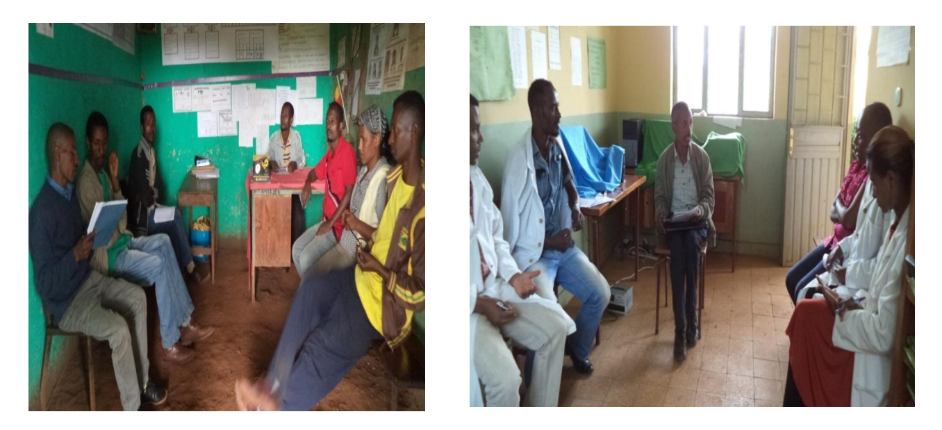
Plate 3. Focus group discussion with Kebele workers Plate 4. Focus group discussion with Challiya Eka health workers