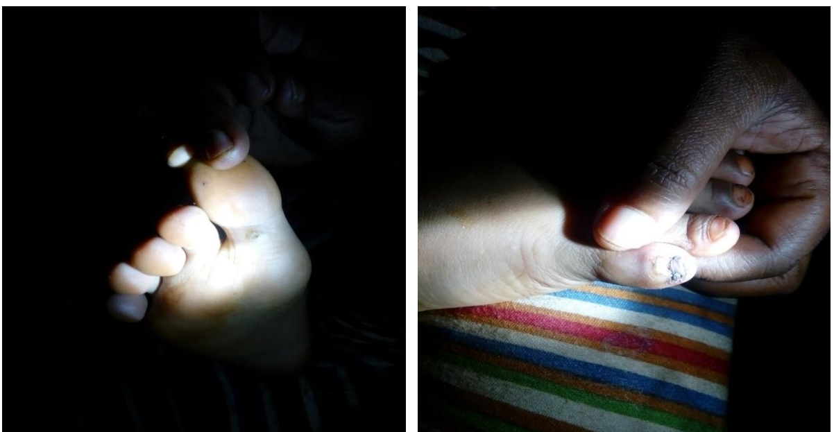
Plate 5 Embedded jigger flea a photo by Taye Berhanu February, 2015Plate 6 Embedded jigger flea a photo by Taye Berhanu February, 2015