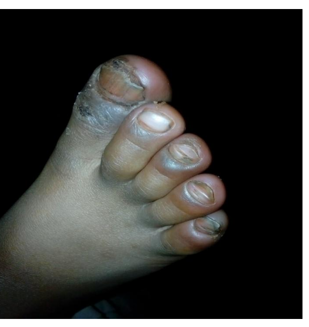
Plate 8 Embedded jigger flea February, 2015