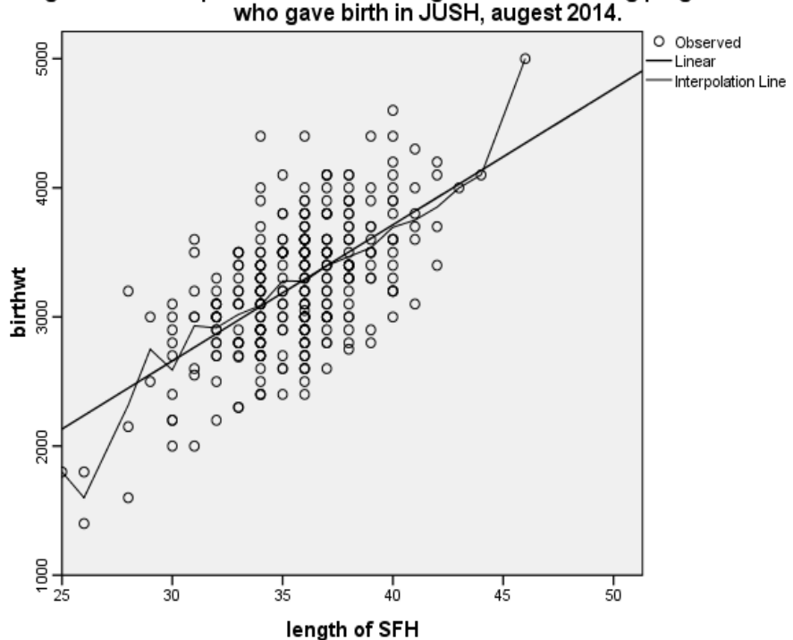
Figure 1. Scatter plot of actual birth weight and SFH among pregnant mothers who gave birth in JUSH, augest 2014.

Equation 5. EFW(gm) = 2600 + 115(SFH (cm) - 30).