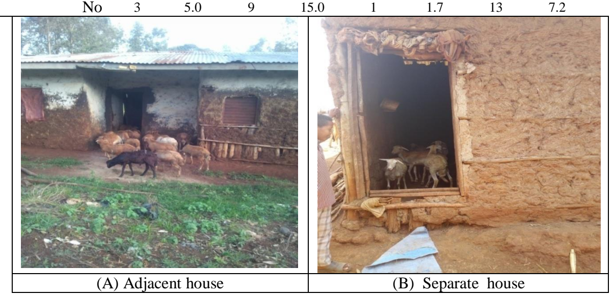
Figure 6: Type of house in the study area

Table 19 : Housing Practices of Households