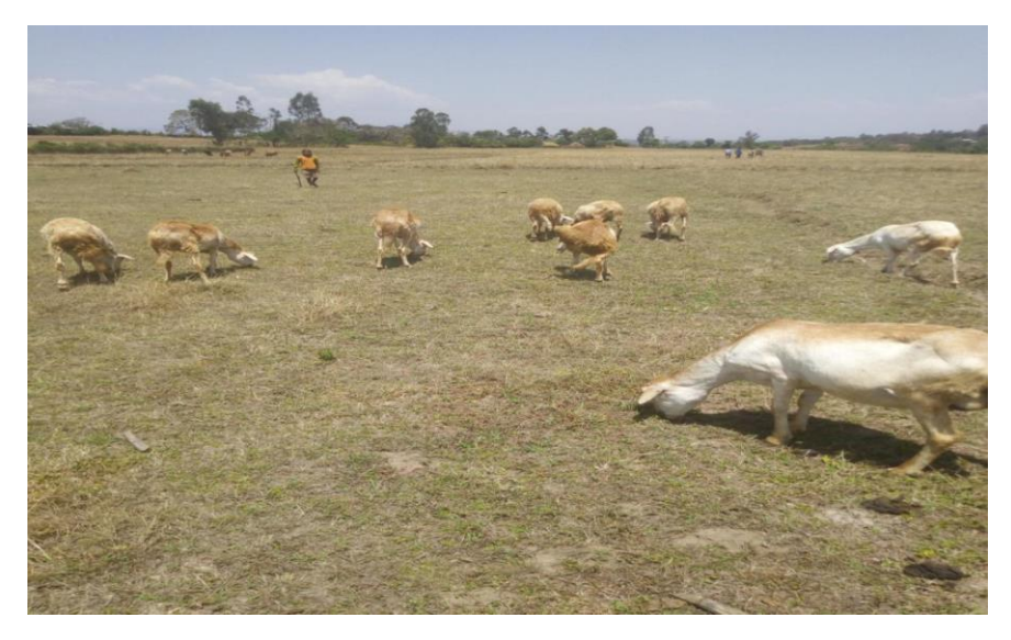
Figure 5: A flock of sheep herded grazing in Omo/nada area