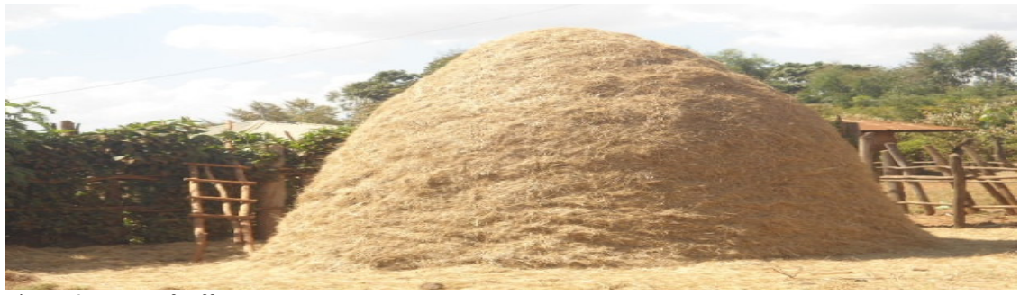
Figure 2. Heap of teff straw

In case of maize, 82.7% of the respondents from the highland and 26.7% from the mid altitude areas harvest the ears and leave the stover for on field grazing. Less maize stover is collected and stored for animal feeding because of its bulky nature and difficulty for transportation and because of its use as fuel wood. Other crop residues like wheat and barley straw and pulse haulms are less conserved and commonly left on the treshing area for in situ grazing. Similar report was published by Owen and Aboud (1988) who reported the bulky nature of crop residues and lack of means of transportation to be among the factors that constrain the collection and greater use of straws and stovers as feed. This also conforms to the report of McIntire et al (1989) who reported in situ grazing of crop residues throughout sub-Saharan Africa.