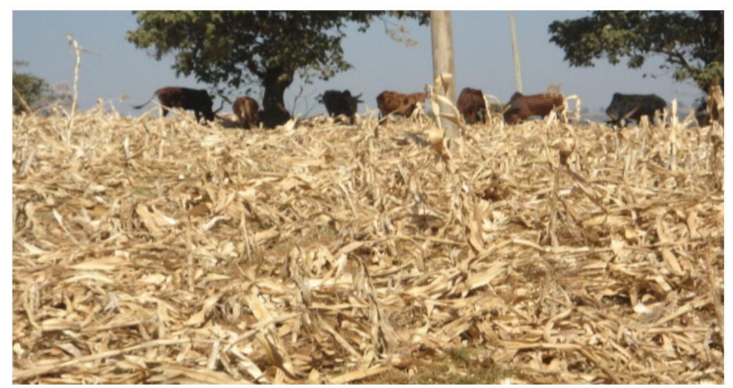
Fig.3 In situ (on field) grazing system of maize stover