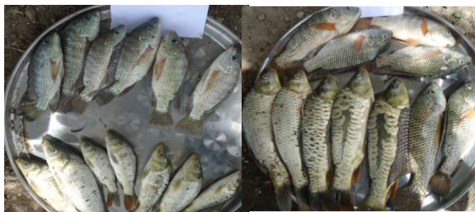
Figure.2 Fish harvested from goat manure fertilized pond (T1, left) and poultry integrated pond (T2, right) at the end of the experimental period.