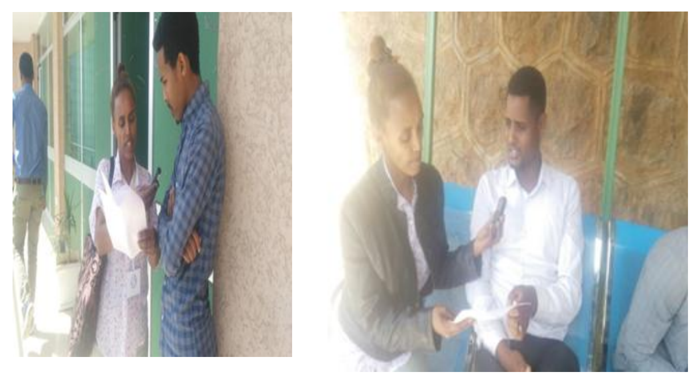
Picture A L TV Sport Journalist Interviewee Picture B Fana TV Sport Journalist Interviewee

Figure 1: Demographic features of the semi structured interview Study Participants (P<sub>1</sub>-P<sub>7</sub>)