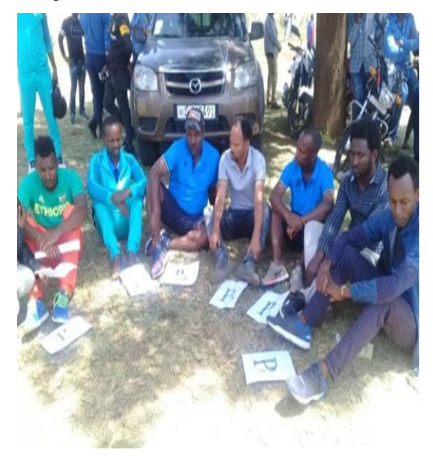
Picture 3: Demographic features of the study participants in FGD interviews of coaches