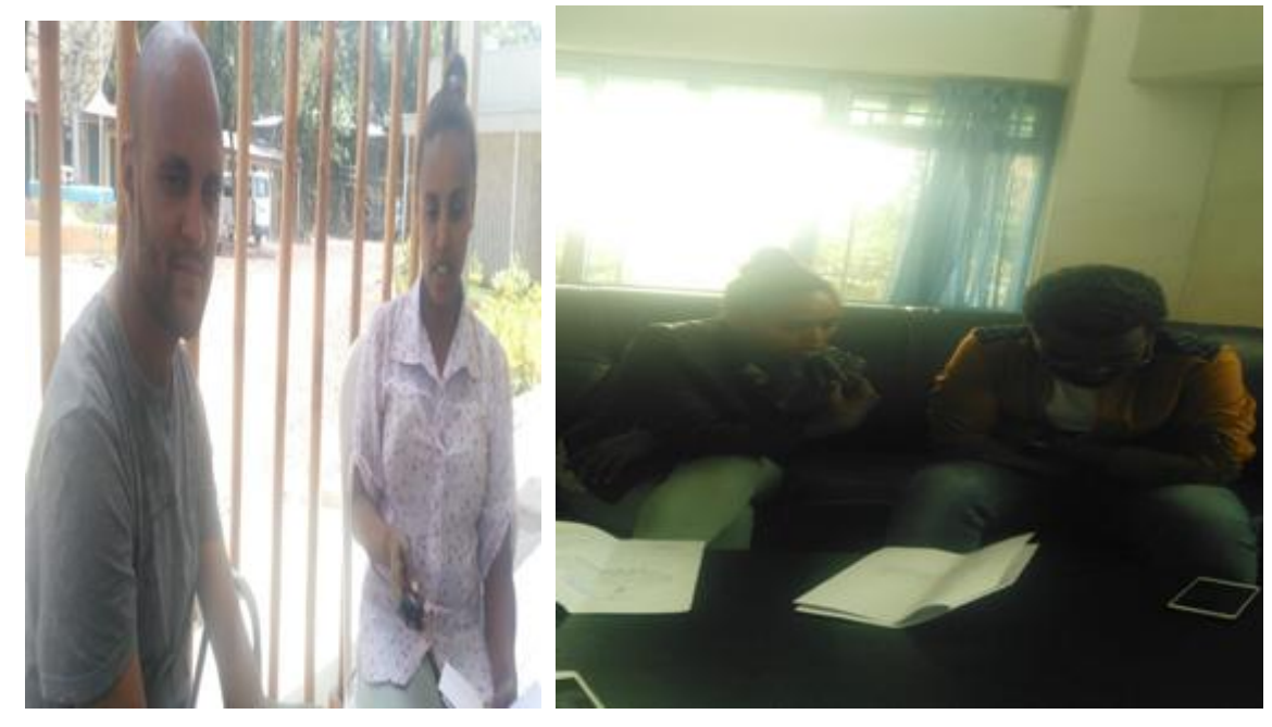
Picture C WALTA TV Sport Journalist Interviewee Picture D EBC TV Sport Journalist Interviewee (P)