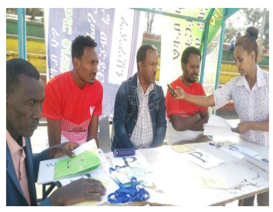
Picture 4: Study participants of the FGD interviewee of Handball federation officials & experts.