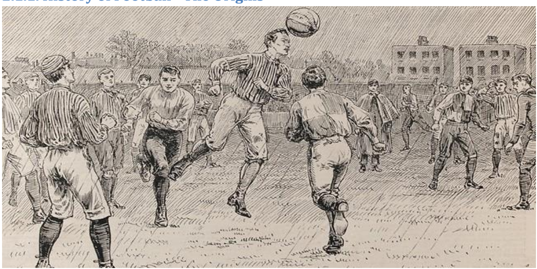
FIG 1 in 1863.