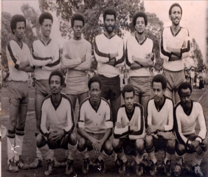
1972 E.C at Nekemte