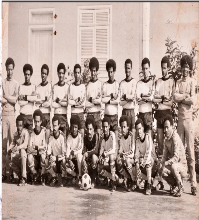
picture 2. Former football players of DembiDollo town picture play at different cities.