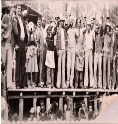
1972 A.E.C during welcome Dembi Dollo football team was champions at all wollega competition.