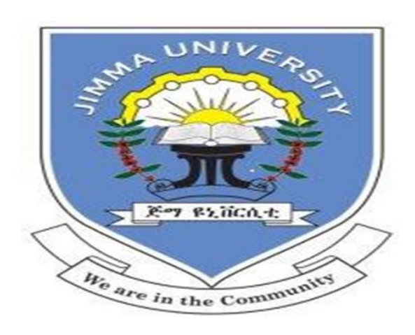
BY: GETNET TAFESE (B. PHARM)

AVAILABILITY AND AFFORDABILTIY OF SELECTED ESSENTIAL MEDICINES IN HEALTH CARE FACILITIES IN HAWASSA TOWN, SNNPR, ETHIOPIA