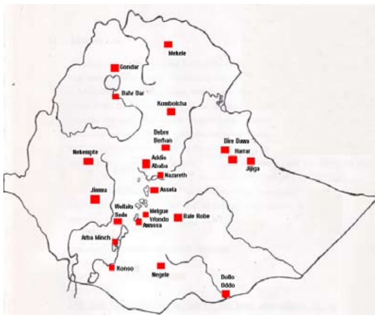
Figure 1: Map of Ethiopia showing the locations of abattoirs where the surveys were carried out.