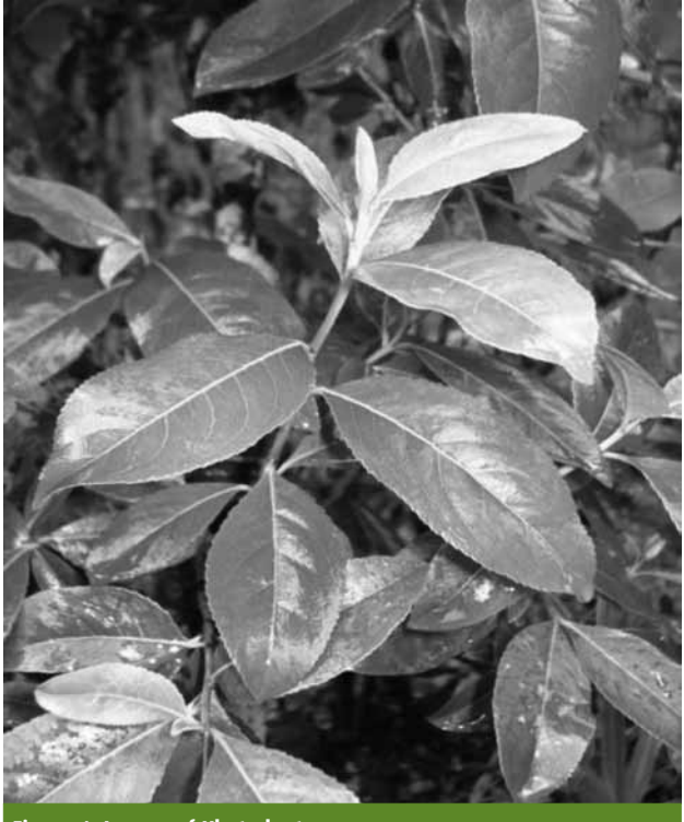
Figure 1: Leaves of Khat plant

in libido (4). There is fairly extensive literature on the potential adverse effects of habitual use of khat on mental, physical, and social well-being (5). Some khat chewers experience anxiety, tension, restlessness, hypnogogic hallucinations, hypomania, and aggressive behaviour or psychosis (6,7). Chronic consumption can lead to impairment in mental health, possibly contributing to personality disorders and mental deterioration (8,9). Khat leaves has vasoconstrictor properties (10) that may lead to elevated blood pressure, increase in heart rate and increased incidence of acute myocardial infarction (AMI) (11,12). Gastro-intestinal hazards include constipation, stomatitis, esophagitis, and gastritis (13). A significant association between the habit of khat chewing and the development of haemorrhoidal disease was reported (14). Besides damaging health, Khat has adverse socio-economic consequences and effects on many other aspects of life including the loss of thousands of acres of arable land and billions of hours of work (15).