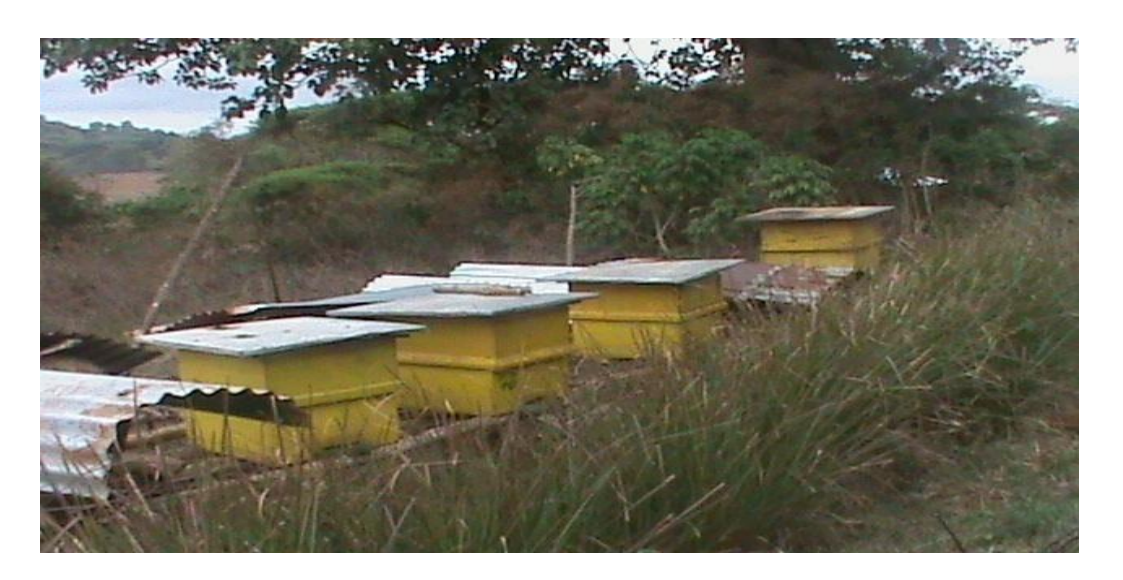
Plate 4: Shaded less hives covered with grasses (Photo taken during field observation)