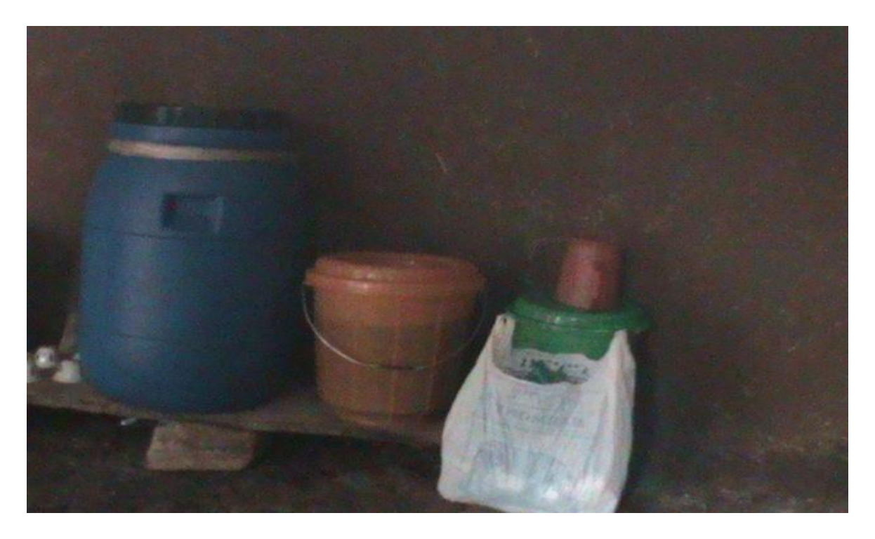
Plate 13: Honey storing equipments