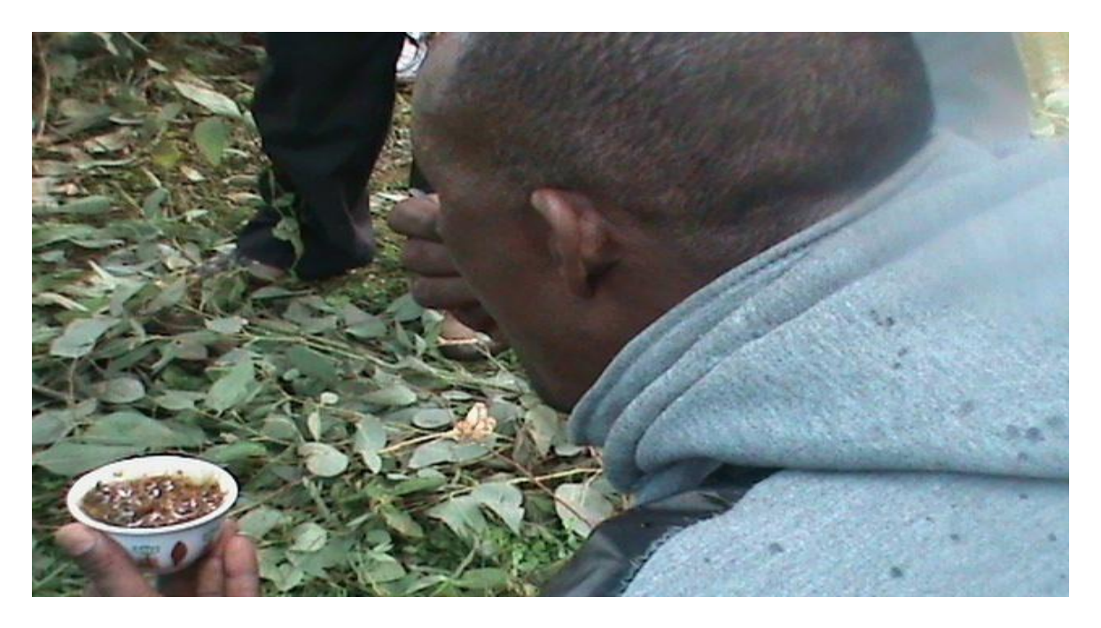
Plate 12: Tasting honey