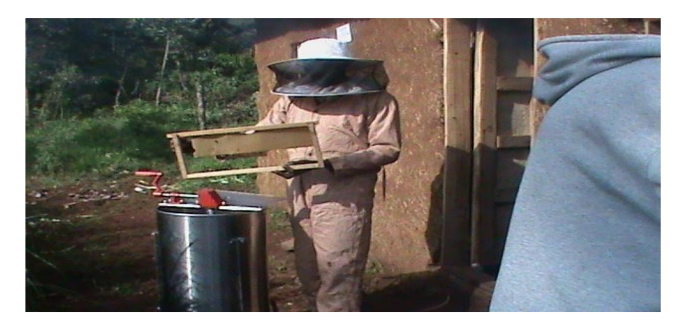
Plate 9: Bee protecting wear, frame and honey extractor