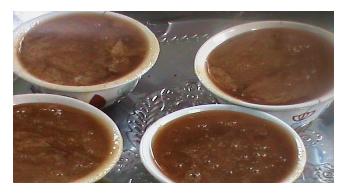
Plate 11: Extracted honey