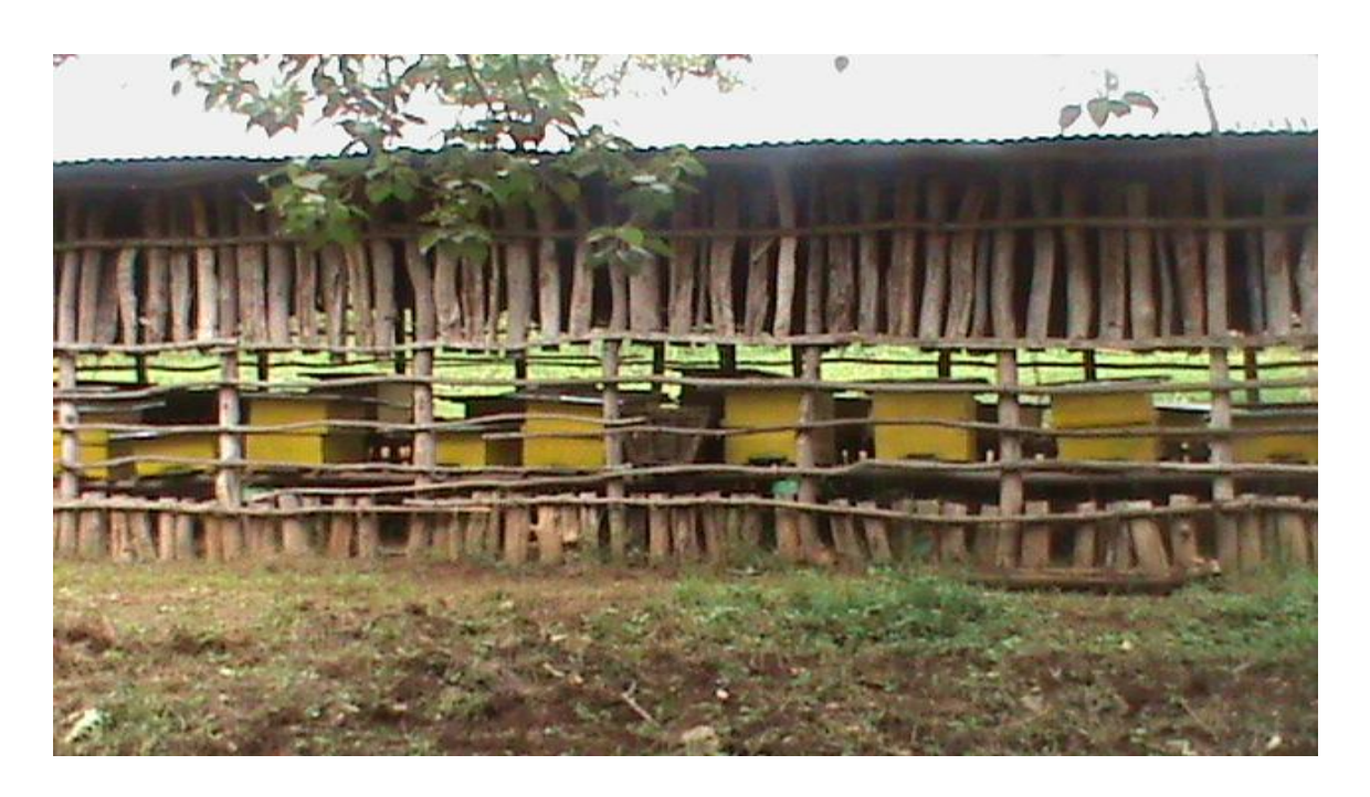
Plate 7: Properly handled modern hive