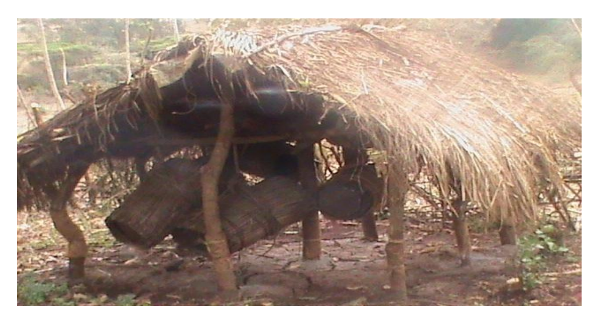
Plate 6: Backyard Bee keeping