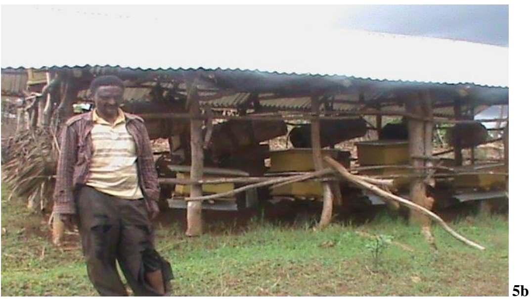
Plate 5: Miss handled or inappropriately put modern and traditional hives (a and b)