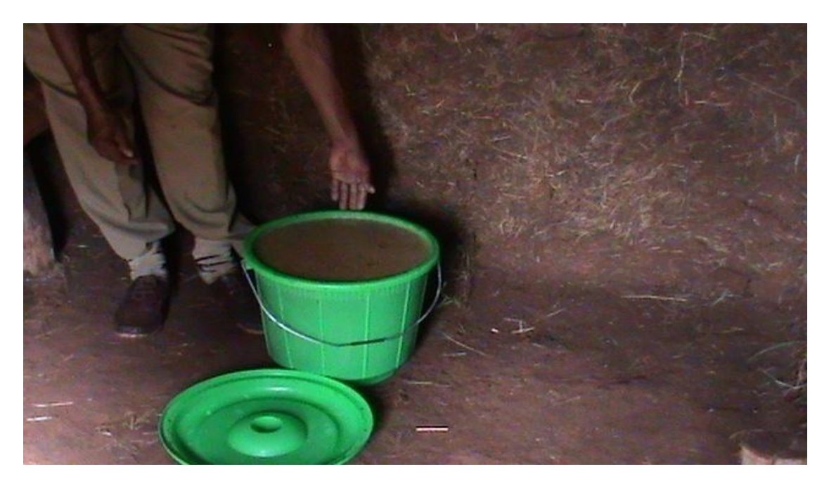
Plate 10: Harvested honey