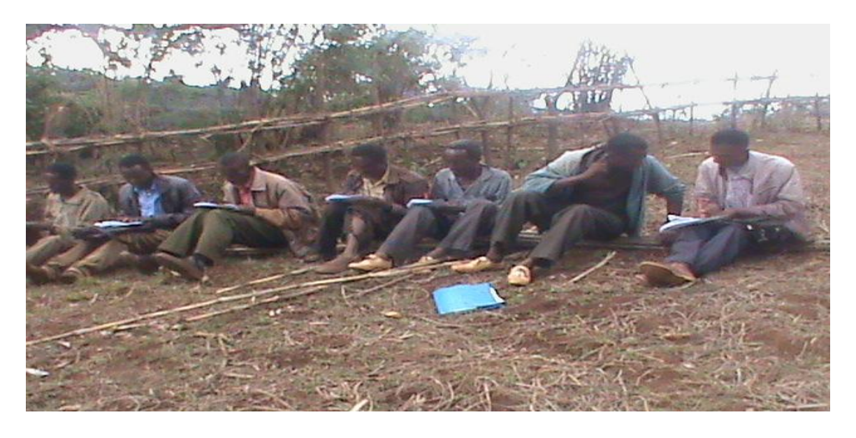
Plate 2: Discussion with focus group