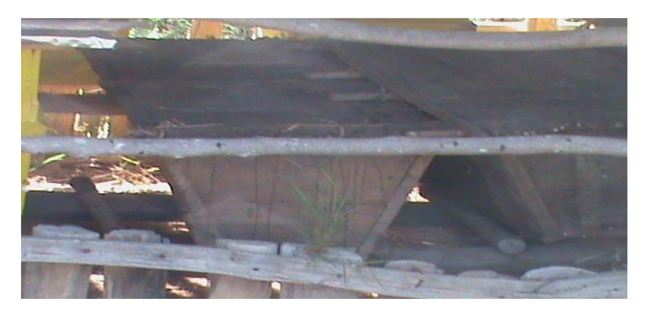
Plate 8: Transitional hives