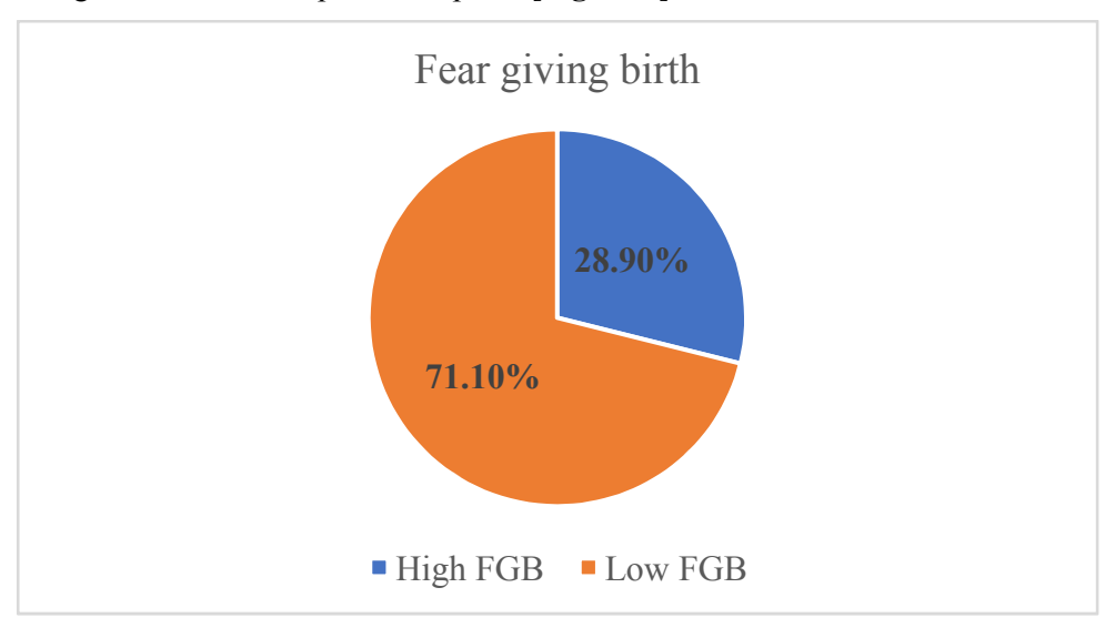
Figure 3 : Magnitude of Childbirth fear among Pregnant Women at West Wollega Public Hospitals, West Wollega Zone, Oromiya Region, Ethiopia, 2020 (N = 298)

From the 298 respondents interviewed, 86(28.9%) experienced high Childbirth fear among pregnant women attending antenatal care at public hospitals [ Figure 3 ].