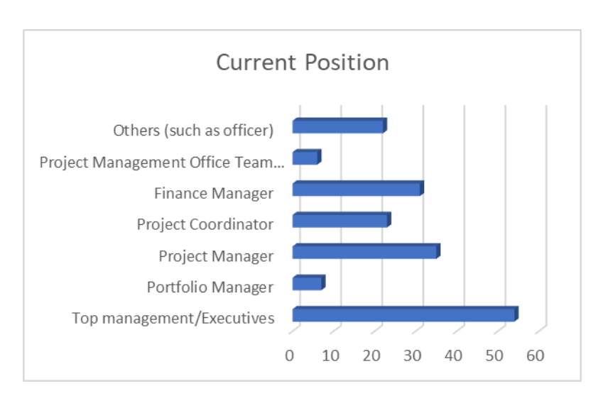
Figure 7: Response for "Current position of the respondents in the organization"