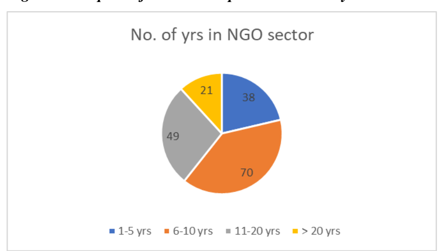
Figure 5: Response for "Work experience/Service years in NGO"

Accordingly, the above figure shows that the respondents hold only two types of educational qualifications; Bachelor's degree and master's degree. Majority of the sample group were master's degree holders which account for 73% while bachelor's degree holders account only for 27%. This implies that educated people of any of the two types of qualifications were assumed to be employees of the Local NGO'S who are directly or indirectly associated with project works and have at least the basic knowledge about project implementation and factors that affect its implementation.