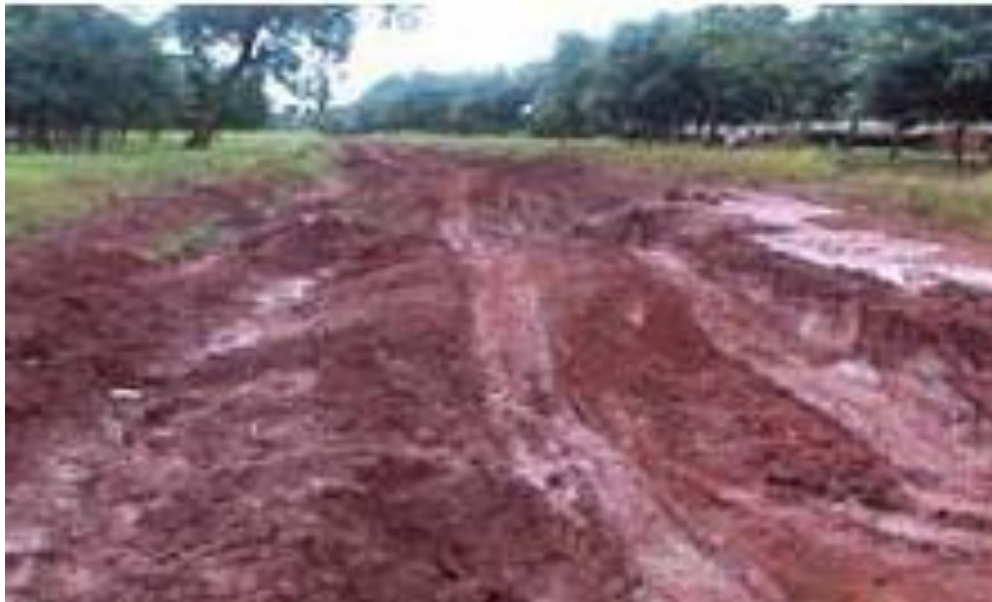
Figure 1. Roads with potholes, ruts, and mud (Picture taken from Gera District Office of Road