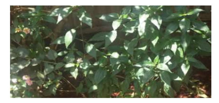
Fig. 3 Damaakasee Papaya and Andoodee (Carica Papaya & Phytolacca Dodecandra)

The folk healers believe that if the patient could not get the necessary treatment at the early stage of the disease, it may result in deafness. According to the informants<sup>4</sup>, this medicine is also given based on the duration of the disease for 3 and more days as determined by the folk healer. And damaakasee is also very curative medicinal plant to treat michii in the area.