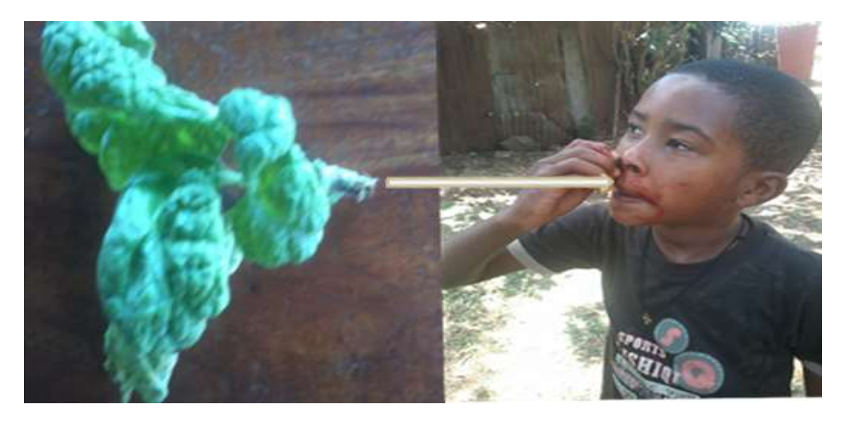
Fig. 4 A patient getting Folk Treatment with Tamboo Adii to cure Nasal Bleeding

According to my informants, this medicinal plant is not only for livestock it also used to treat a person who affected by dhalaandhula insect. Especially, children seen while they affected drinking water with their mouth from river carelessly. Lastly, the leaf of white tobacco (tamboo adii) used to control Nasal bleeding epistaxis which is literally called ( funuuna in afan Oromo). The local folk healer cut the leaf of ' tamboo adii ' white tobacco and insert it in the nose of the patient by massaging gentle on the palm. After a few minutes bleeding epistaxis or stop amazingly.