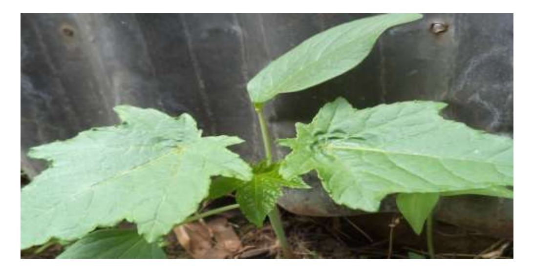
Fig. 12 Qobboo Plant

until it destroys all roots of the disease. According to the folk healers of the study areas, large number of the patients use this folk medicine since there is no effective bio-medicinal drug.