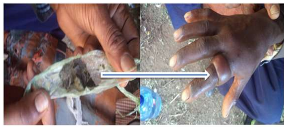
Fig. 2 Folk healer utilizing Hadha's medicine to cure patient's affected hand

The name of this medicinal plant is intentionally left blank because its exact name is deemed not to be mentioned. However, the leaf of this medicinal plant is common to treat the disease called hadhaa . Sometimes hadhaa also known by the name ' koskosso ' in study areas. According to a folk healer from Agaro town, Ethiopia, hadha or koskosso is caused by insect which lives in warm areas or places like waste products of coffee. As one of the informants<sup>2</sup> stated hadhaa is an insect with six small legs. 'Hadhaa' is an Afaan Oromo term which implies a powerful poison. The six legs help to transmit this toxic to livestock or human beings.