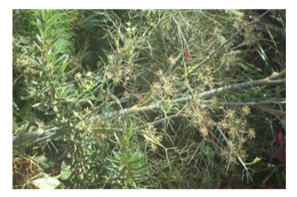
Fig. 7 Dimbilaala plant

According to one of the informants<sup>8</sup>, the leaf of this folk medicinal plant uses to treat chronic diseases like diabetes and blood pressure. This medicinal plant found in the resident's garden by cultivation. The leaf of this plant is collected from garden and cooked for about one hour. Then it is given to the patient early in the morning before breakfast for at least three to five days<sup>9</sup>.