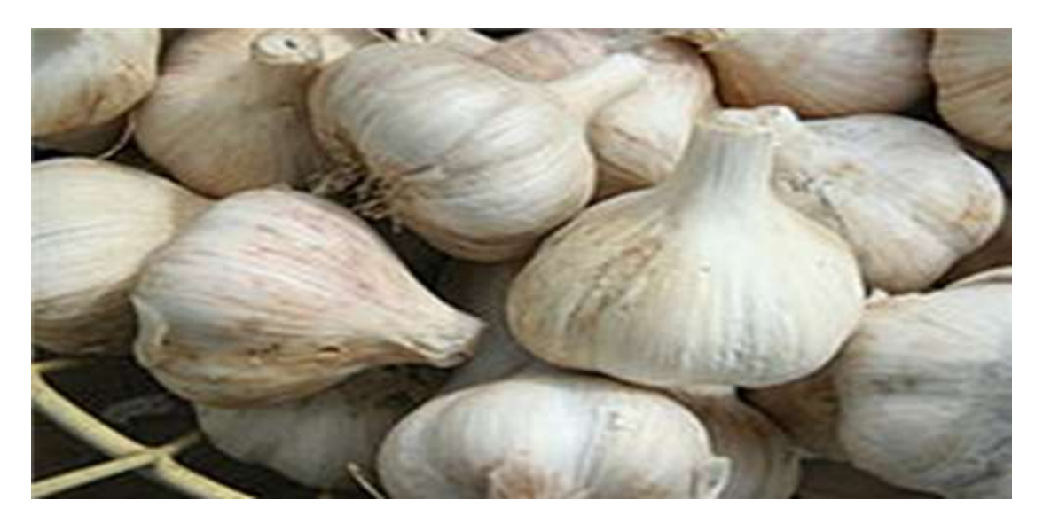
Fig. 15 Qullubbii Adii (Garlic)

It has to be noted that Qullubbii adii is not long lasting for the patient to recover from this illness. In contrast to this, traditional folk healer can heal or treat the patient by grinding onion with soot (' qaqaa ' in Afaan Oromo). By doing so, the patient has to take it at least for 3 to 7 days every morning time before breakfast. This cultural treatment destroys its root which deepens in the body system. Most of the time ' dhullaa ' found on the seven or seventeen areas of the patient.