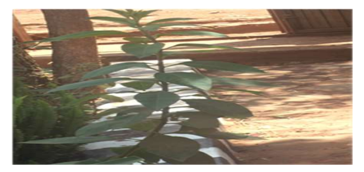
Fig. 8 Eebichaa plant