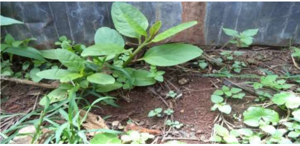
Fig. 9 Andoodee Plant

In the study area the leaf of Andoodee is operative medicine for diseases such as ' madaa mataa ' (the wound of head skin). Skin diseases called 'Baarile' and ' Roobbii ' is believed to be caused by gorora , saliva of other person when touches the face). And this folk illness most of the time found on children's face. For this folk medicinal plant has the nature of soft like soap, it is easy to wash the affected face of the patient with it. Sometime people of the area use handodee as soap to wash their cloth. According to the informants, this should be continued at least for three to five days<sup>10</sup>.