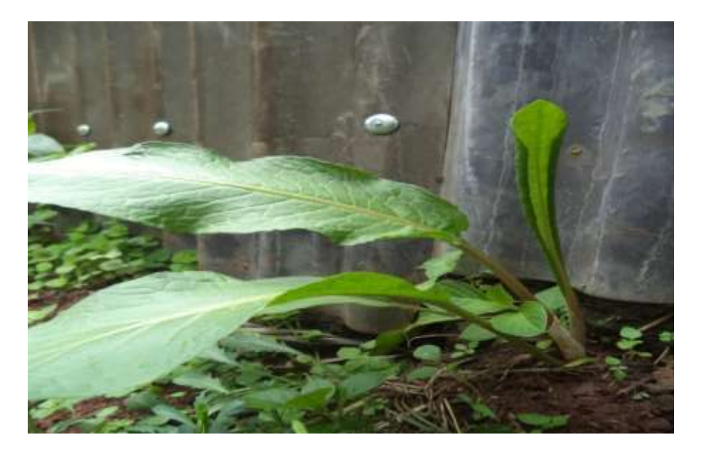
Fig. 14 Shulti plant

In the study areas, folk healer uses the root of ' shulti ' plant to abort unwanted pregnancy. This medicinal plant widely used both in Agaro and Jimma town.