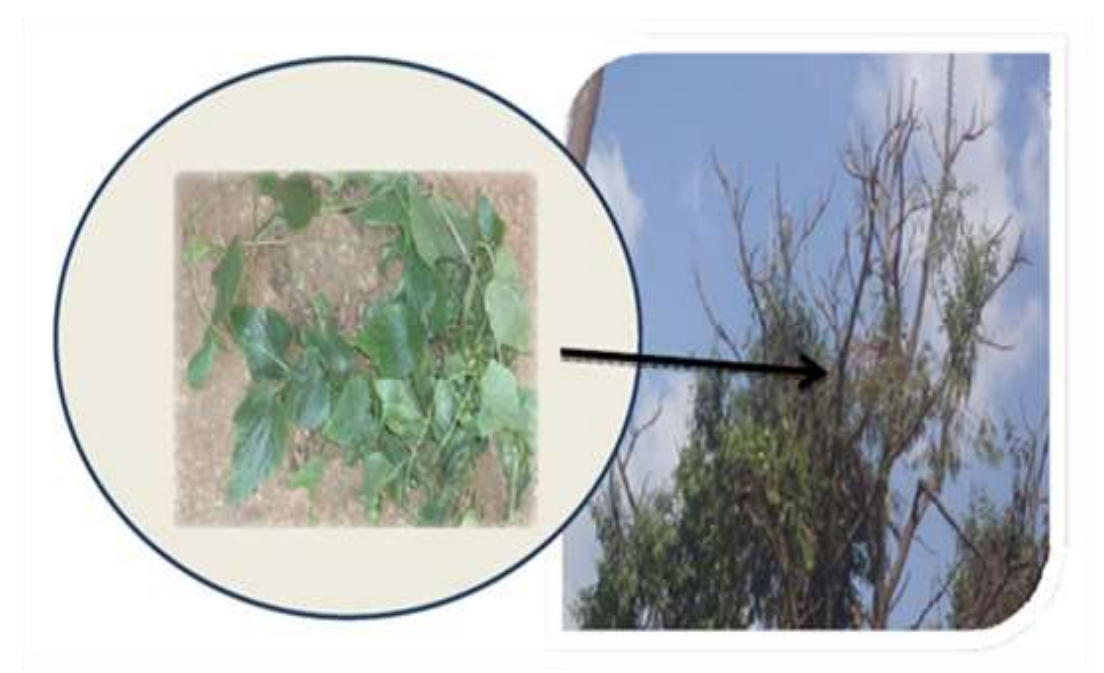
Fig. 11 Hidda Reeffaa Plant

The root of this folk medicinal plant is not grown independently as a plant. But, hidda reeffaa is grown or found on the other plants as parasite; mostly of the time ' hidda reeffaa ' is a root found on the huge trees and it is not found everywhere; rather it is available in areas of forest coverage. The root of this folk medicinal plant is grinded and boiled with sugar to treat the mother gave birth (delivery and who aborts in order to cleans unwanted bloods and dirty liquids out of their body.