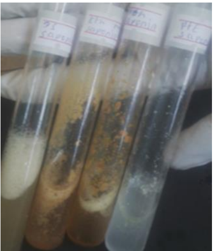
Fig 2: phytochemical screening of secondary metabolite