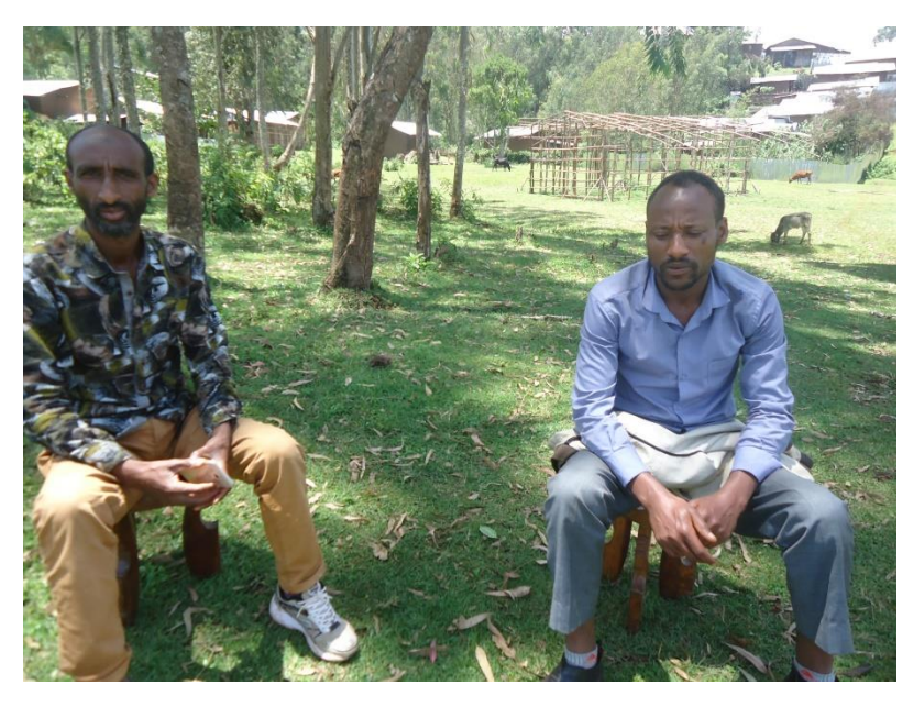
4.8 Key Informant of Culture and Tourism Office (KICT1 and KICT2)