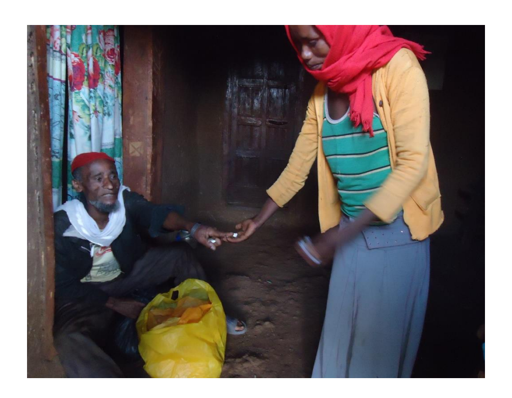
4.6 The Healer treated Indigenous Medicine for patient Photo by Dinberu murch 2020