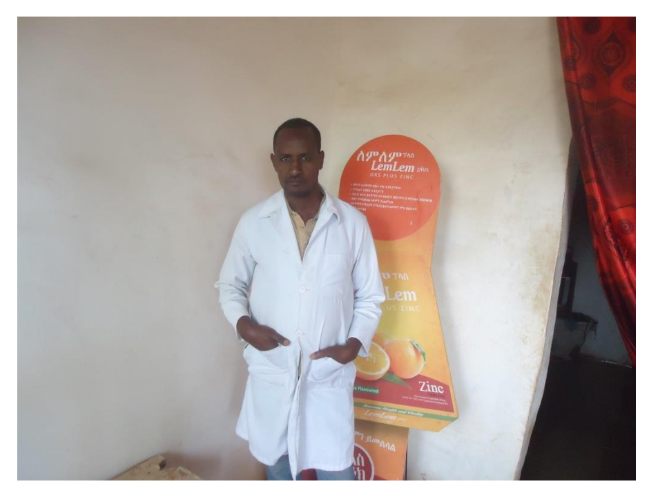
5.1Key informant Biomedical Worker (KIBMW2)