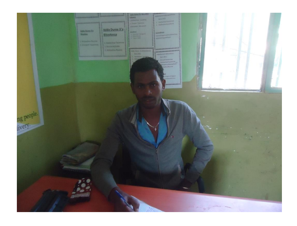
5.2 Key informant of Biomedicine worker (KIBMW1)