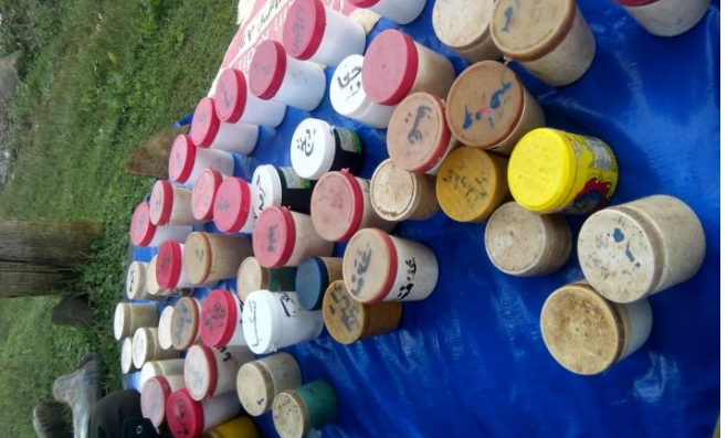
4.2 Practicing Herbal Medicine from the Quran