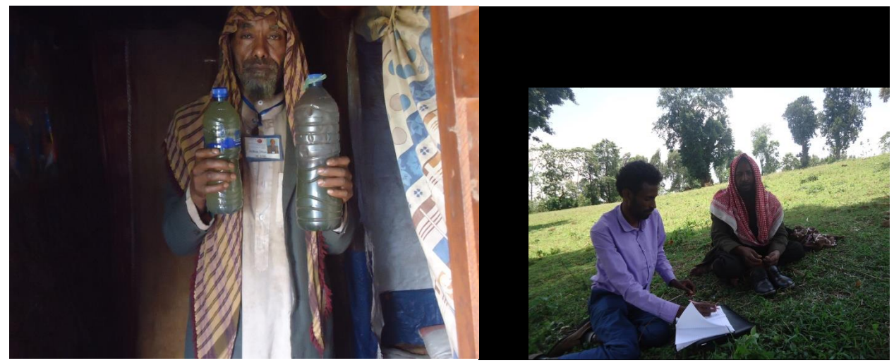
4.7Key Informant IndigenousHealer (KIIH3