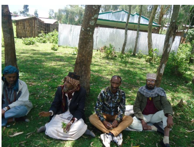
4.9 FGD1 Indigenous Healer