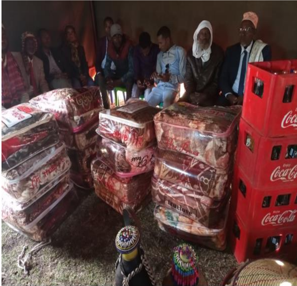
Fig 4: A blankets given to the girl's family