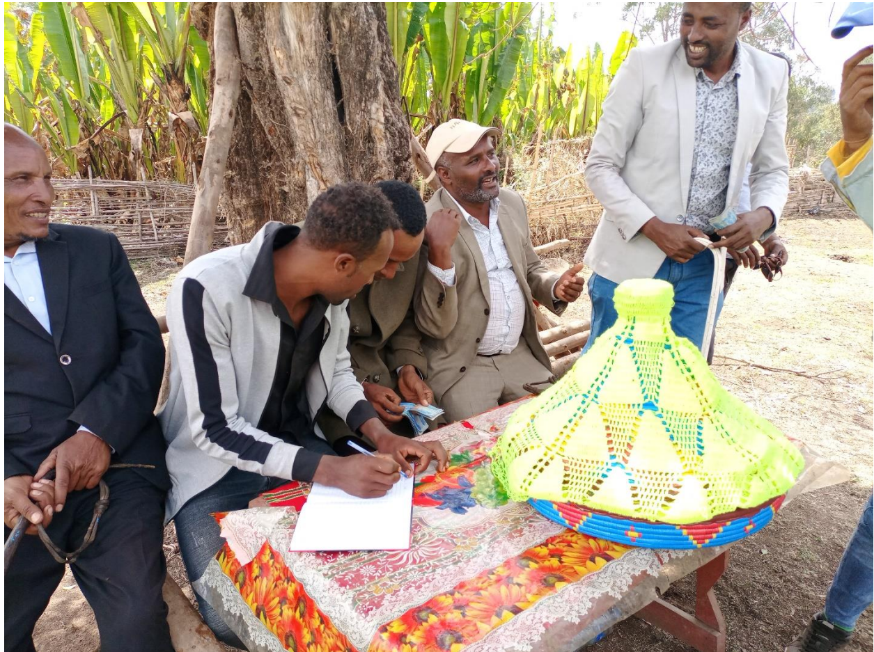
Fig 10: Assigned individuals by the bride's family to collecting money from the community