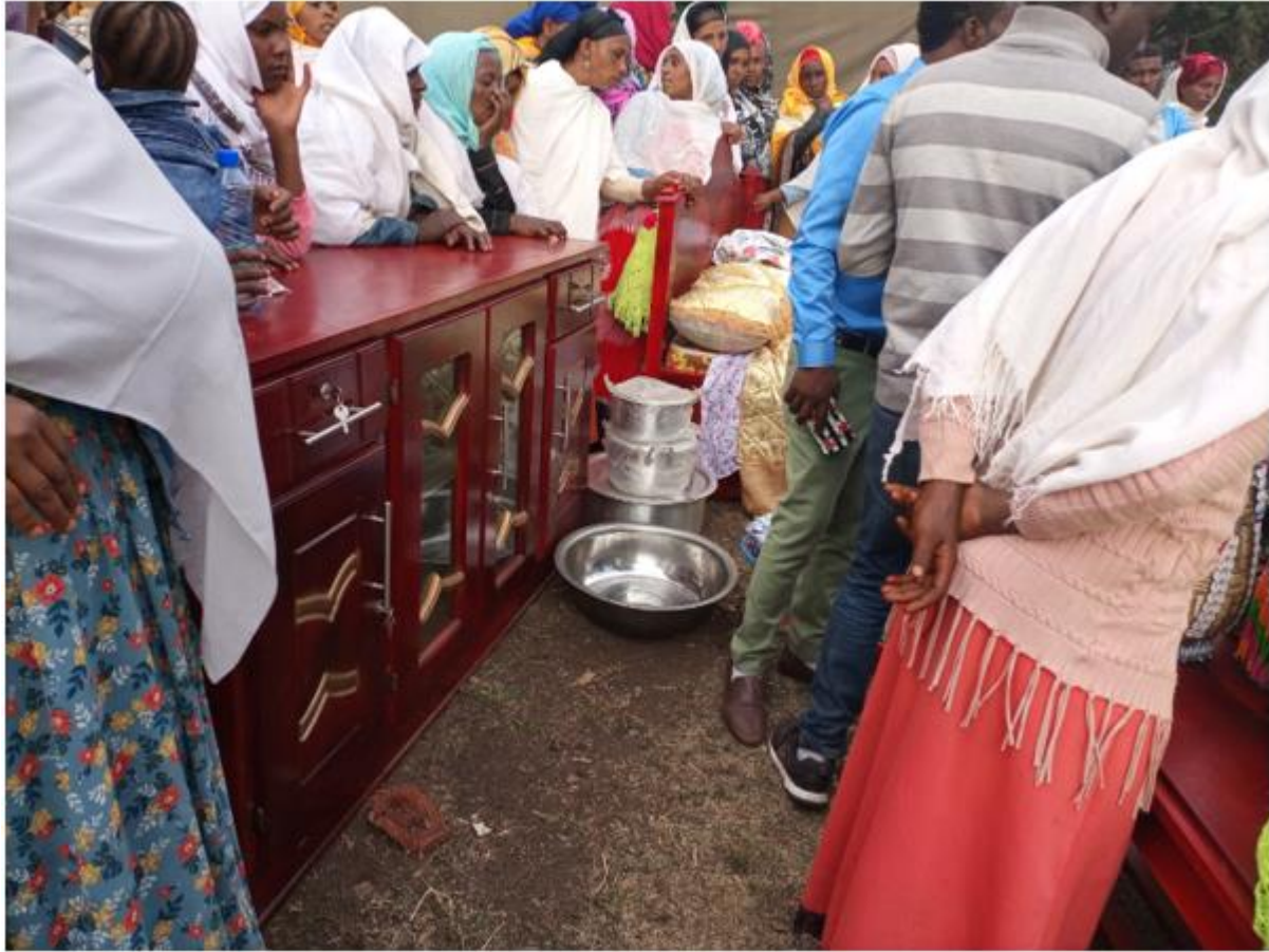
Fig 7: Sideboard and other household furniture given by the bride's family

Besides, this picture shows, those so-called modern and expensive sideboards and other items. Here the sideboard has a great social value for the bride's family and the son-in-law because giving such items will provide prestige and respect in the community. However, it's hard for the poor to afford; so that they are forced to ask for support from others.