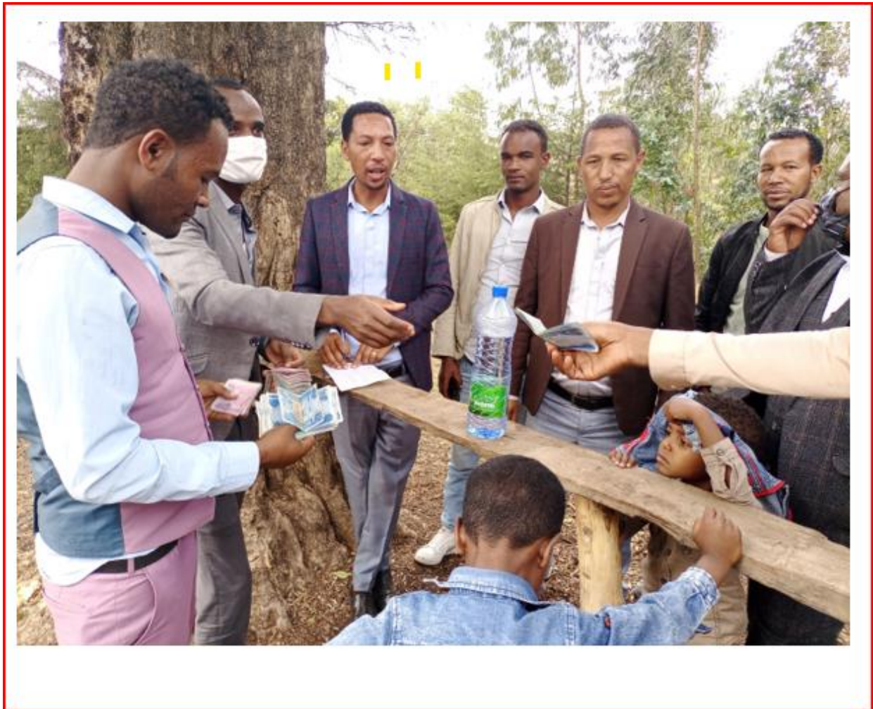
Fig 8: When the bride father's close relatives contributing money to her father