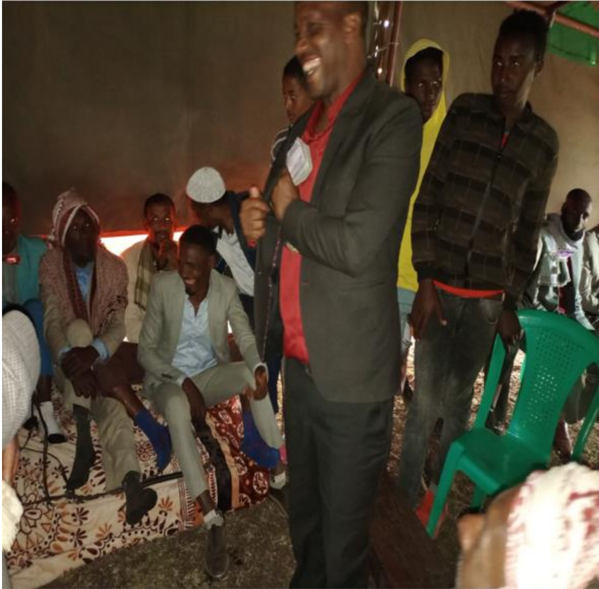
Fig3: A money given instead of heads of cattle (Loon gabbara)