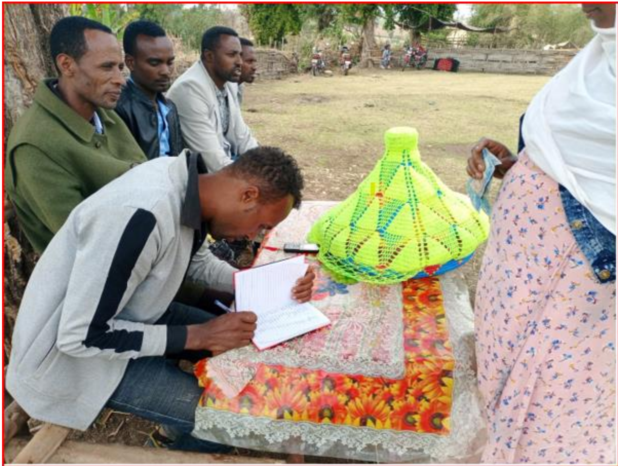
Fig 9: Assigned individuals by the bride's family to collecting money from the community