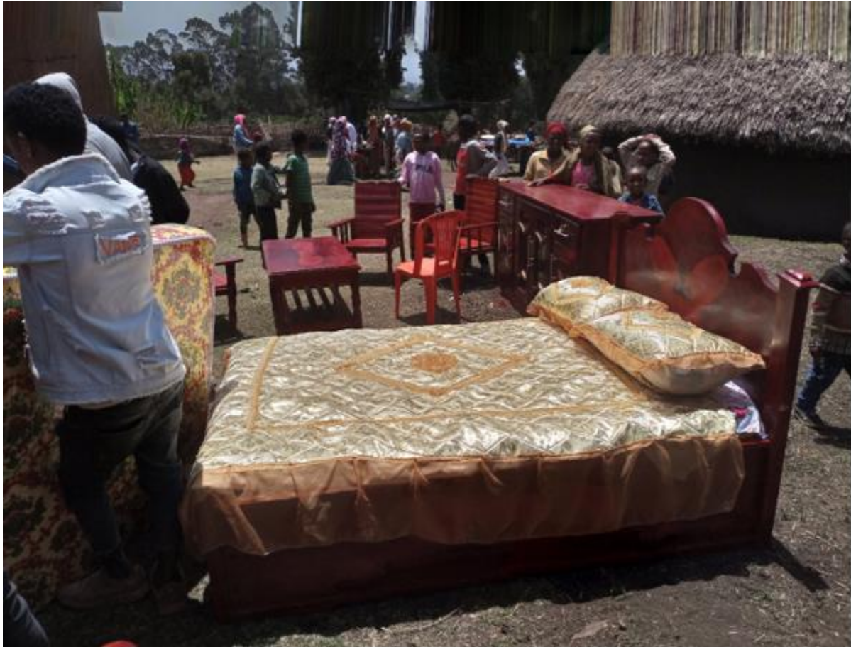
Fig 5: Bed and other furniture given by the bride's family for the newly married couples