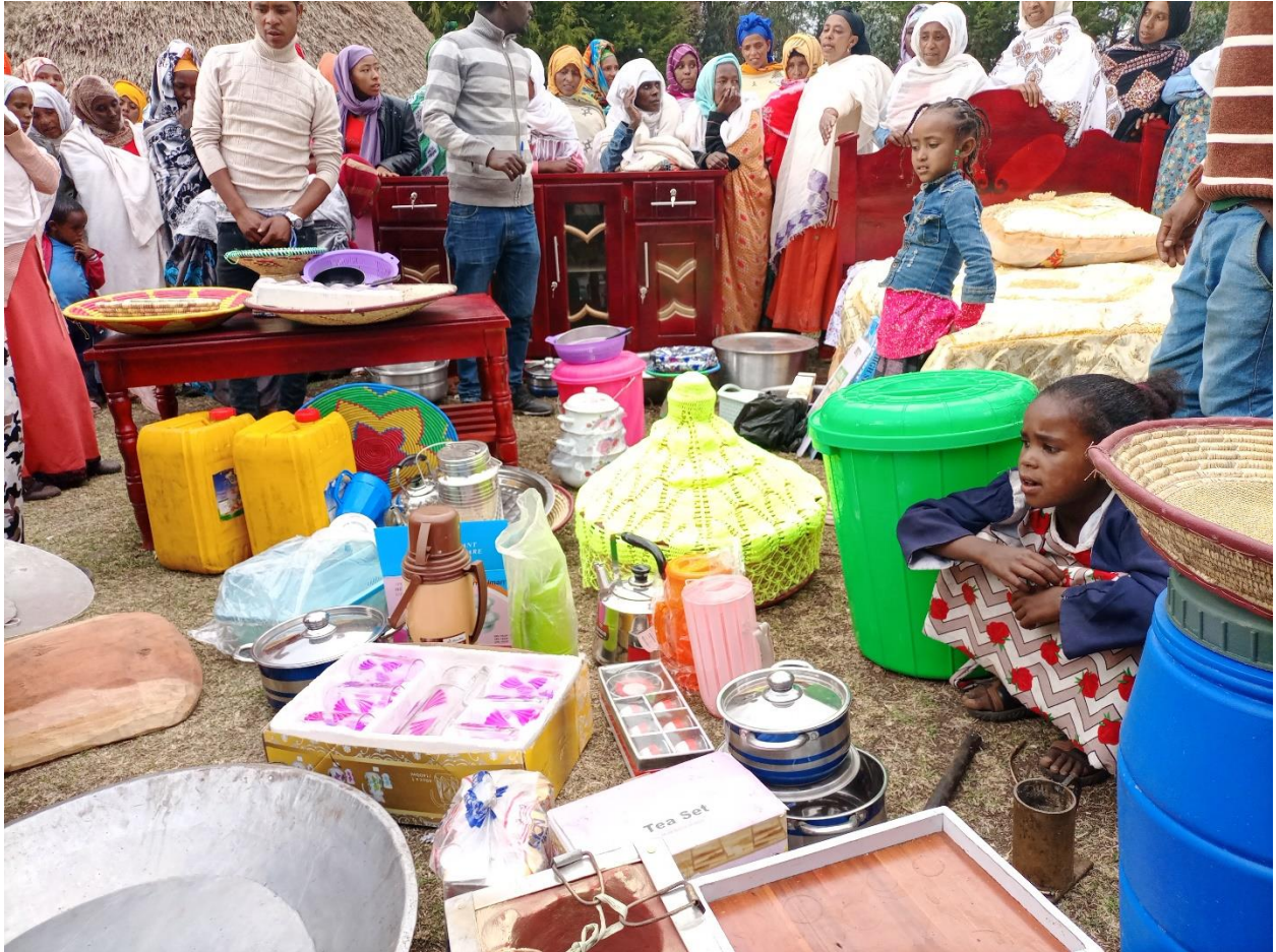
Fig 6: Different household materials given by the bride's family to the couple

In addition to the above-mentioned bed and furniture, the girl's family also gives different household materials for their daughter and the son-in-law. This is because the bride's family is obliged to provide any items that are deemed necessary.