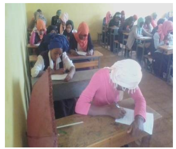
P <sub>1</sub>: Respondent students at Sekoru 2<sup>ndary</sup> School