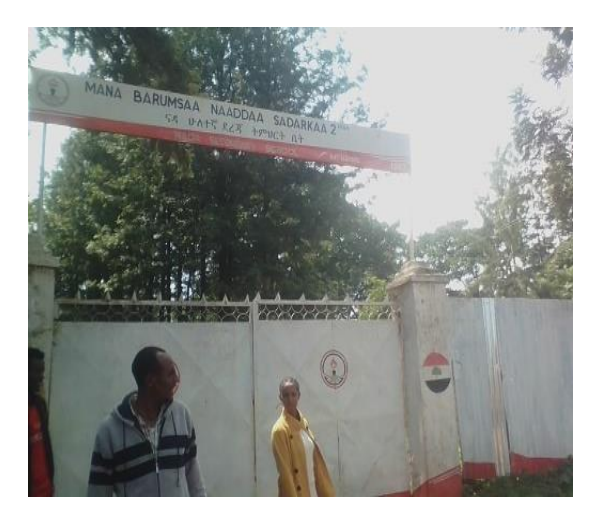
S<sub>3</sub>: Nada Secondary School