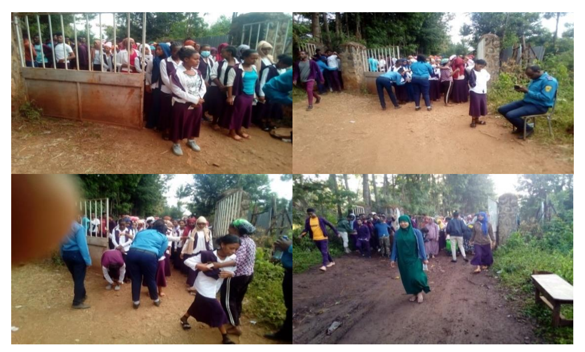
Picture-2: Controlling system to avoid academic cheating during National Exam

Picture-2 shows the controlling system for avoidance of academic cheating problems during National exam. The pictures were collected from two of the selected secondary schools (Namely, Sekoru & Deneba Secondary Schools). This picture data was needed to show the practice of schools to reduce students' academic cheating behaviors. Although police personnel usually trying to control cheating on National exams, the practical evidence indicates that many students are trying to smuggle mobiles in to the exam rooms. It shows how students' academic cheating problem becomes more serious due to the effect mobile