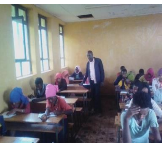
P<sub>2</sub>: Respondent students at Deneba 2<sup>ndary</sup> School