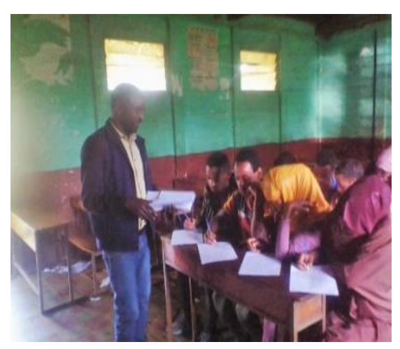
P<sub>3</sub>: Respondent students at Nada 2<sup>ndary</sup> School