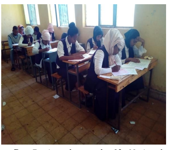
P<sub>6</sub>: During the grade 12 National Exam at one of the studied schools