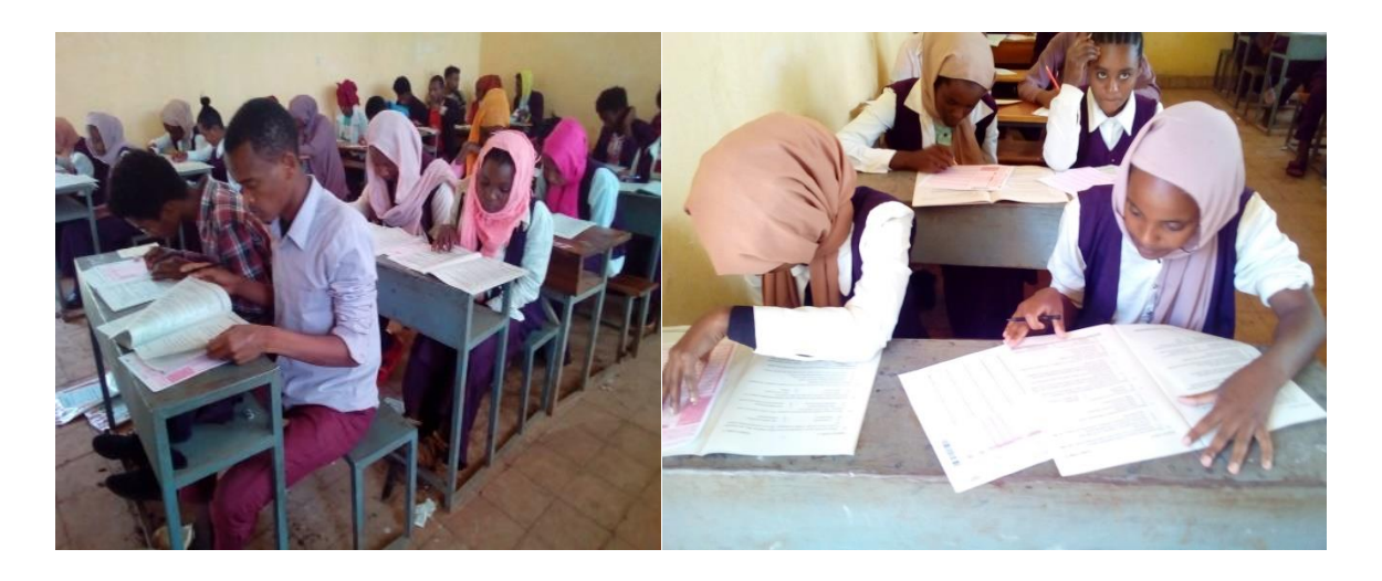
Picture-3: Students' academic cheating practice on National Examination

Picture-3 was taken from one of the studied schools, during Grade-12 National exam of this year. It was to show some practical experiences of students' academic cheating during National examination. As identified by analysis of quantitative data, students used different techniques of academic cheating. As shown on the left side of picture-3; some students are in the situation of cheating on examination; because students, who were at the back side of seating, have observed as they were discussing and exchanging exam paper for cheating. Similarly, the students on the right hand side of this picture also were in the same situation. As shown in front of the camera, one student was looking the invigilator seriously, to cheat from others. Some students in both examination classes have been caught with their mobile phone. In conclusion, the lack of implementation for examination code of ethics may lead students' behavior towards academic cheating.