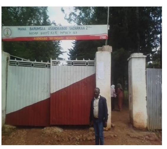
S<sub>4</sub>: Asendabo Secondary School