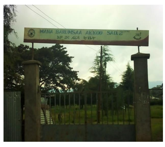
S<sub>6</sub>: Ako Secondary School