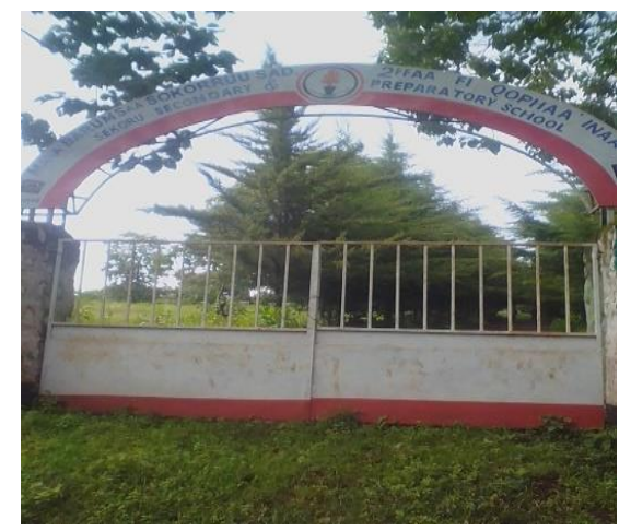
S<sub>1</sub>: Sekoru Secondary School