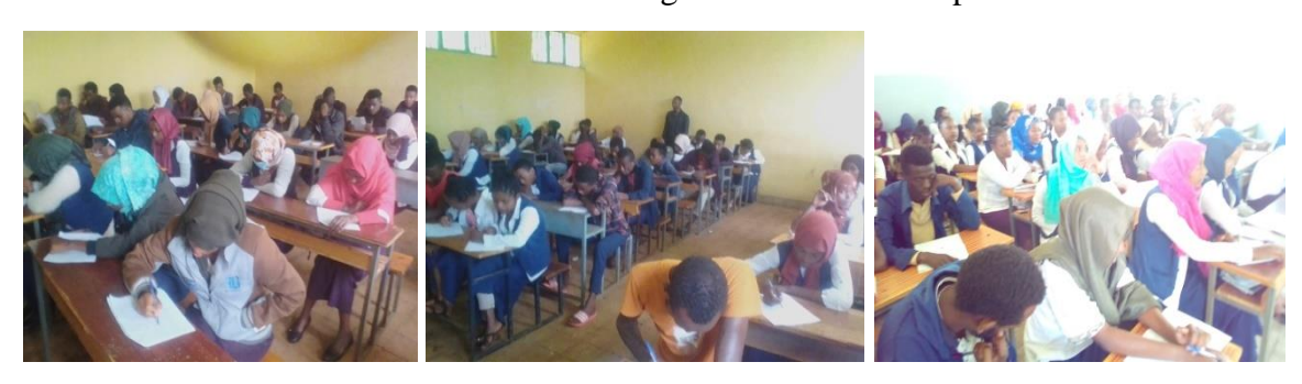
Picture 6: The overcrowded exam rooms during observation in sample schools

The other observed related factor was the Class-student ratio. According to INEE and Ethiopia Education Cluster (2013 p.58) the national standard of teacher to student ratio is 1:50 at primary and 1:40 at secondary level. So the recent Ethiopian standard for Class-student ratio of secondary school is 1:40. But during this observation the Class-Student ratio was 1:56 as shown in the picture 4. This means it is possible to say the examination class size in many secondary schools can cause students to engage in academic cheating. Because, many students were subjected to copy from each other, not only this but also they were motivated to cheat from each other