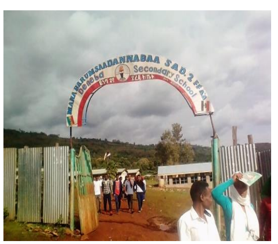
S<sub>2</sub>: Deneba Secondary School