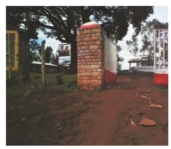
S<sub>5</sub>: Dimtu Secondary School