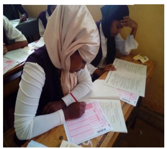
P<sub>5</sub>: During the grade 12 National Exam at one of the studied schools