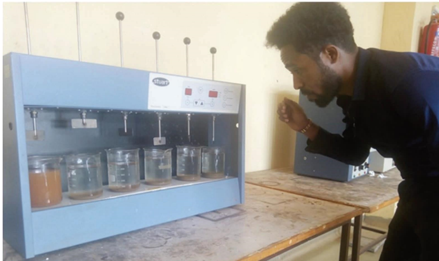
FIGURE 3: Experimental result after coagulation and flocculation process.