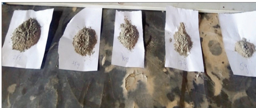
FIGURE 1: Dosage of wood ash and cement.