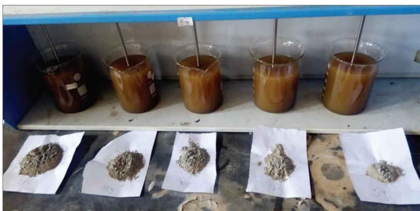
FIGURE 2: Jar test and dosage.

that can settle more rapidly, the rotation speed of the blades was reduced. By decreasing the rotation speed of the stirrers, the particles were encouraged to agglomerate and form flocs, facilitating their settling. In this case, stirrers were allowed to rotate at a speed of 90 rpm for 15 minutes.