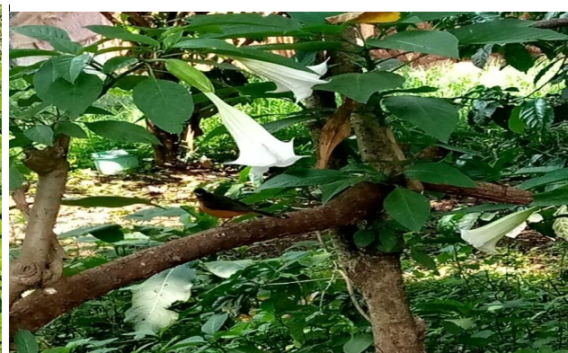
Figure 4. Birds observed in vegetation patches