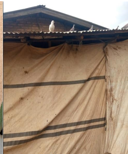
Figure3. Birds observed in building site