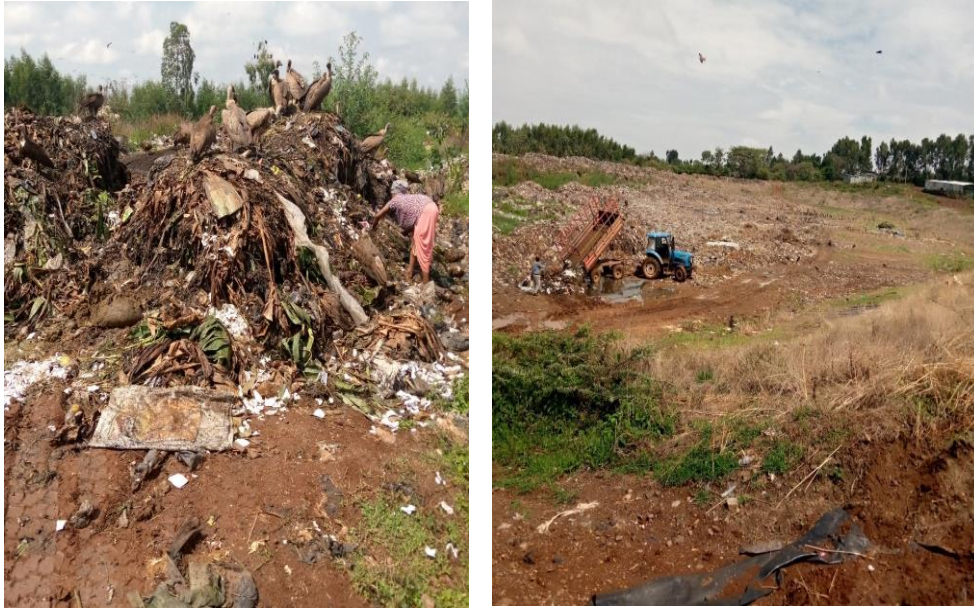
Figure 5. Waste dumping site birds