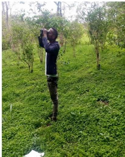
Figure2. Observation of birds by binocular

Bird identifications and counting of individuals was conducted by direct observations with naked eyes or using binoculars (figure 2). The observed species was differentiated by their external morphologies like wing, leg, tail, beak, color etc. The observed birds were identified on site using birds field guide book (Redman et al. , 2016). The species were identified and recorded on the data sheet prepared for that purpose (Girmay et al. , 2020).