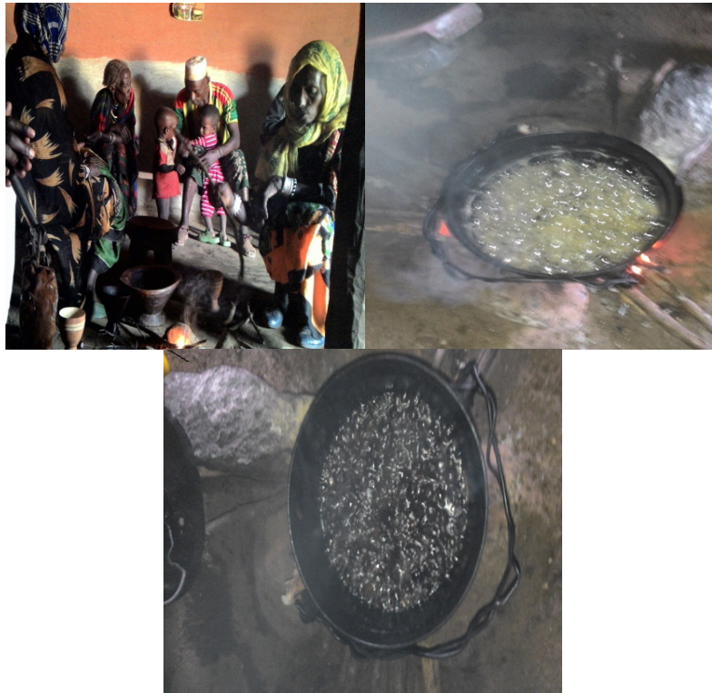
Figure 2. Buna Qalaa Ritual (Boorana, April, 2016)