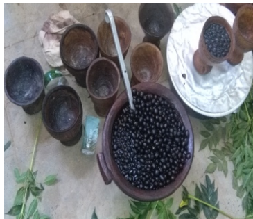
Figure 1. Buna qalaa ready to be eaten

After that, a salt bar is added to the mixture in order to make it sweet though today it is largely being replaced by sugar. It is then slaughtered and divided into two. When it is cooked, butter is added to it. When it cools, that is the point at which the coffee bean is separated. After the milk, butter, the slaughtered coffee is digested well, and it is added to qorii for the attendants.